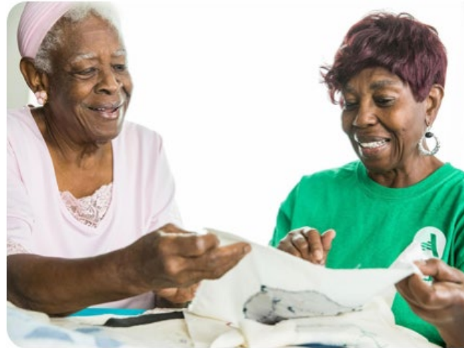
Senior Companion Program