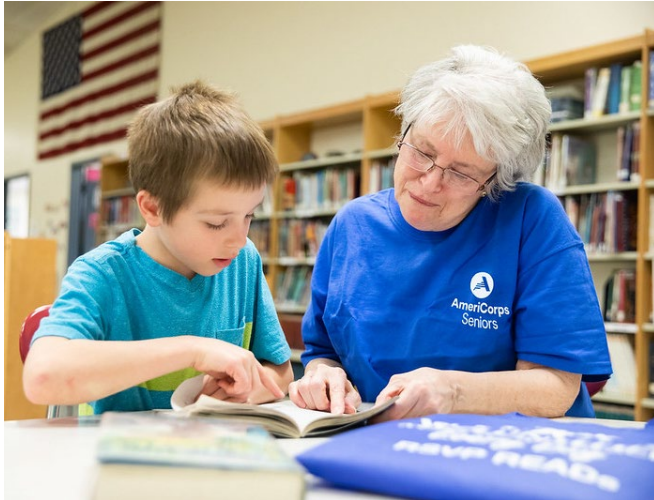
Foster Grandparent Program