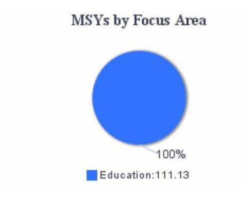
Table1: MSYs by Focus Areas

Table 1 and its corresponding pie chart show the total number of MSYs by Focus Area. Since both the K-12 Success and School Readiness objectives are in the Education Focus Area, Table 1 shows 100% of MSYs in Education.