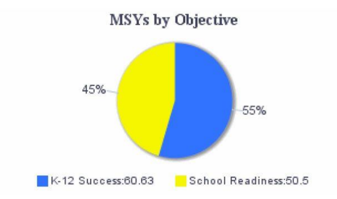
Table2: MSYs by Objectives

Table 2 and its corresponding pie chart show the same MSY information expressed as percentages of the total MSYs: