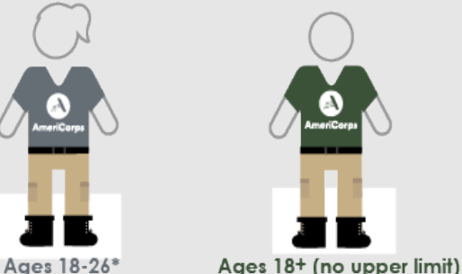
Ages 18. (no opper iimii)