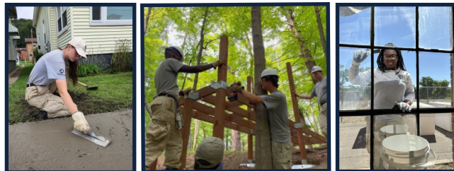
Strengthening communities and developing leaders through direct, team-based national and community service

See back for available project dates and deadlines.