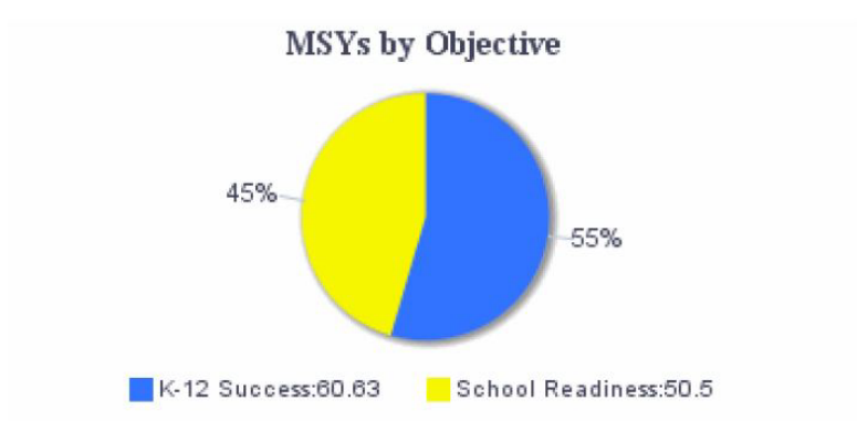
Table2: MSYs by Objectives

Table 2 and its corresponding pie chart show the same MSY information expressed as percentages of the total MSYs: