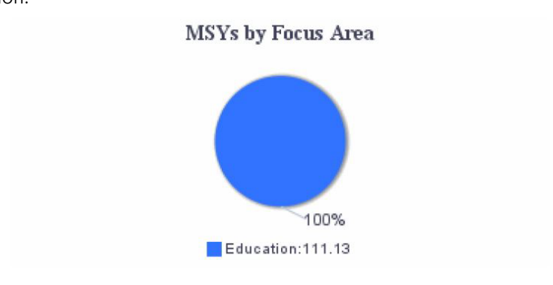
Table1: MSYs by Focus Areas

Table 1 and its corresponding pie chart show the total number of MSYs by Focus Area. Since both the K-12 Success and School Readiness objectives are in the Education Focus Area, Table 1 shows 100% of MSYs in Education.