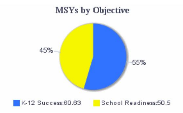
Table2: MSYs by Objectives

Table 2 and its corresponding pie chart show the same MSY information expressed as percentages of the total MSYs: