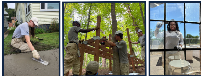
Strengthening communities and developing leaders through direct, team-based national and community service

See back for available project dates and deadlines.