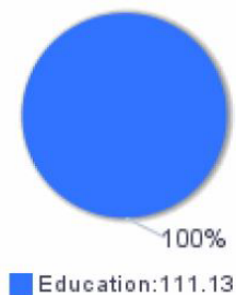
Table 1: MSYs by Focus Areas