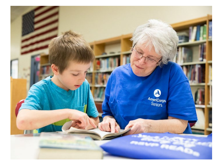
Foster Grandparent Program